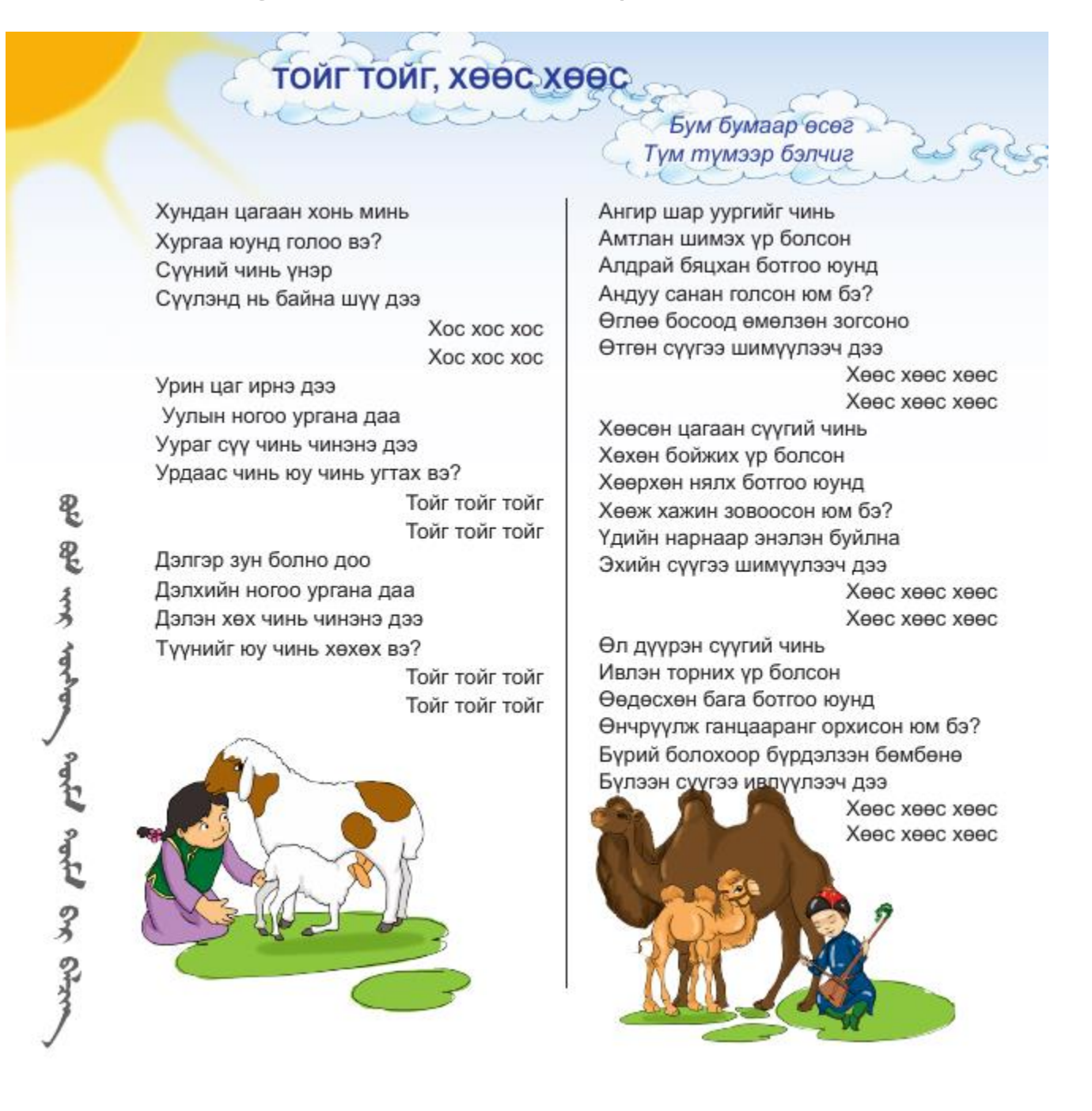
Figure 3: Page from the 2014 Mongolian Grade IV civics Ethics Reader, presenting toig and khöös ritual poems (Tsolmon et al. 2014, 16).