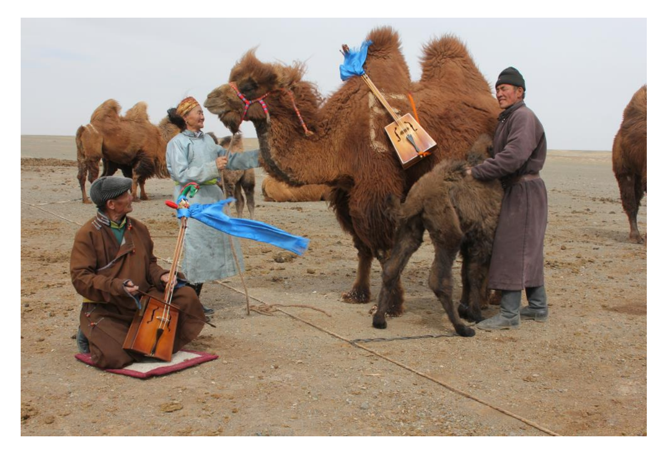
Figure 2: <u>Camel coaxing</u>. Extract from the UNESCO nomination, video by B. Yündenbat.

Sheep are coaxed with melodic calls of toig toig , goats with cheeg cheeg , cows with ööv ööv , and camels with khöös khöös , along with appropriate instrumental melodies or song (Figure 2).