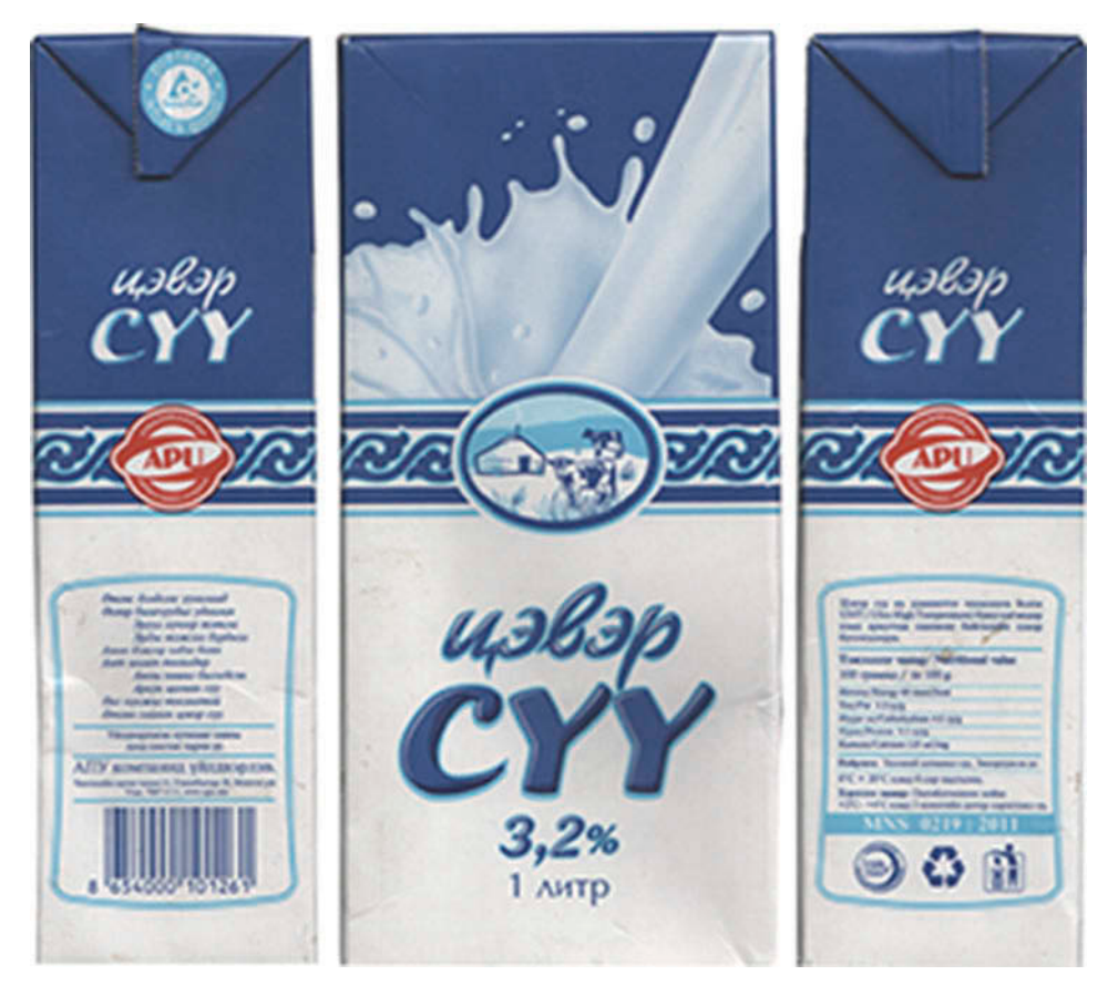
Figure 2. Package of liquid milk produced by the beverage manufacturer APU.

by the blue sky; the wisp of smoke from the chimney of the yurt suggests a calm day. The first side panel describes the milk in terms indicating that the product is actually 'natural' but has simply been packaged using modern technology: 'Pure milk is a pure product of nature that has been sterilized and packaged using UHT progressive technology'; the panel text further indicates a shelf life of 6 months, as well as compliance with MNS 0219:2011 and ISO 22,000 standards. The opposite panel contains a poetic eulogy of 'pure milk', in the manner of the traditional yerööl or magtaal :