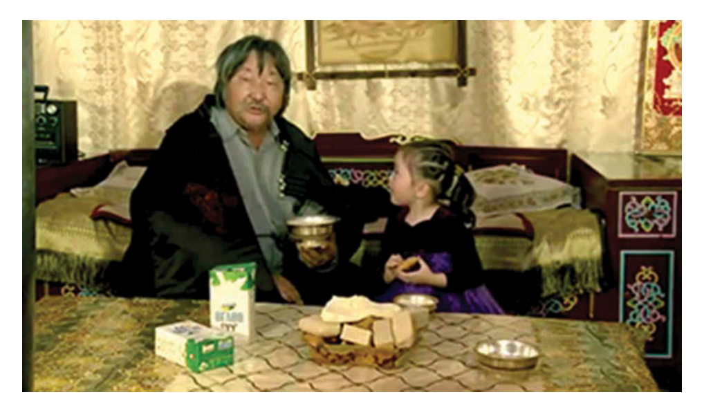
Figure 5. Vitafit 'Morning Milk' commercial. Poet B. Lkhagvasüren drinks milk tea from a silver bowl, as a young girl (implied to be his granddaughter) looks on. Blocks of aaruul and clotted cream are set out on a platter on the table before them. The yurt is revealed – somewhat inconsistently with the exterior depiction of an ordinary pastoral household – to contain fancy furnishings and decorations in the national style, including a leather painting (rear centre) and a Buddhist scroll (right).

offered within a pastoral household, in direct association with objects and practices of a recognizably 'traditional' and 'national' character, within a setting of 'pure nature'. The commercial shows Lkhagvasüren's wife preparing milk tea and making offerings in the direction of the rising sun, after which the poet drinks slowly from a silver bowl, savouring the milk tea. The commercial includes imagery of infant livestock at the tethering line outside the herders' home, livestock heading off to pasture, and a panoramic shot showing the steppe with mountains in the distance and clear blue sky, evoking the 'pure natural landscape' of the Mongolian pastoral countryside.