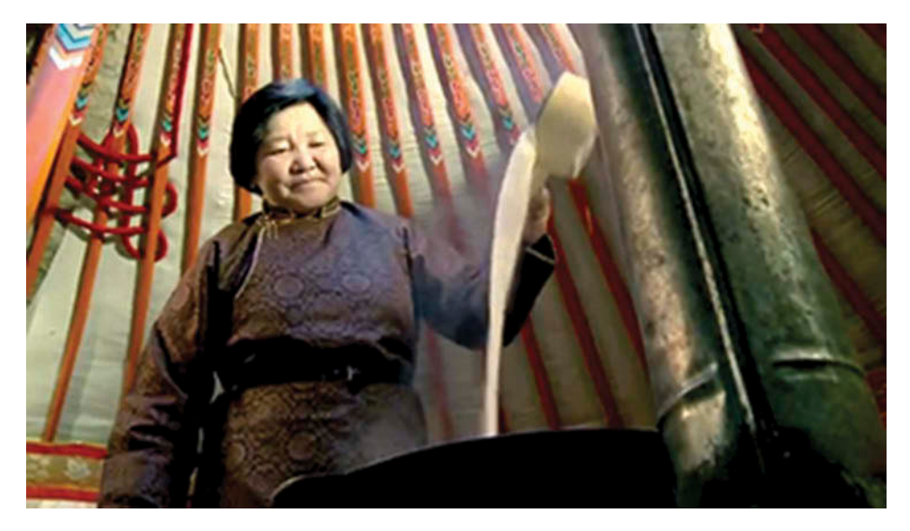
Figure 3. Vitafit 'Morning Milk' commercial. Making milk tea inside the yurt. The action depicted here is süü samrakh, which involves ladling raw milk or tea from the pot and pouring it back in, to allow the milk to scald without boiling over. B. Lkhagvasüren's wife is depicted wearing fancy national dress.