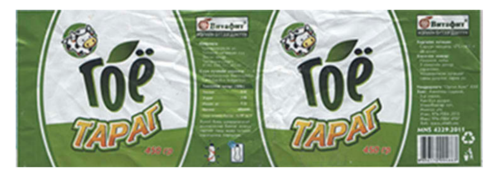
Figure 6. Goyo Tarag label, as updated in 2013. The label reads: 'Ingredients: purified water, dried cow's milk, sugar, stabilizers (E1442, E440, E451, E331III). Lactic acid cultures: Streptococcus thermophilus, Lactobacillus bulgaricus. Storage period: 28 days in cool conditions, +2^{\circ}C-+6^{\circ}C' . The label indicates compliance with standard MNS 4229:2011.

kholboo ) in claiming that bacterial culture counts from laboratory samples of Goyo Tarag had been falsified, as actual live bacteria counts were 100 times lower than the minimum required by law.<sup>33</sup> The NGOs alleged collusion between food safety inspectors and Orgil Foods, asserting that the tarag is an 'ordinary white-coloured beverage' but not a natural dairy product (Figure 6).<sup>34</sup>