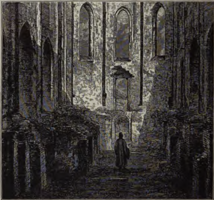
RUINS OF CHAPEL OF SISTERS OF MERCY AT TIENTSIN, DESTROYED BY CHINESE RIOTERS.

After the usual enquiries about our health and safe journey, the Amban said that no Russian had ever before visited Ala-shan ; that he now for the