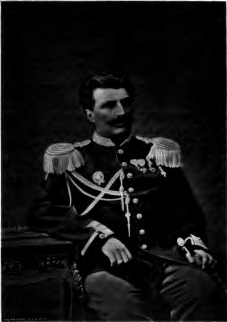
Lt. COL. NICHOLAS MICHAILOVITCH PREJEVALSKY.