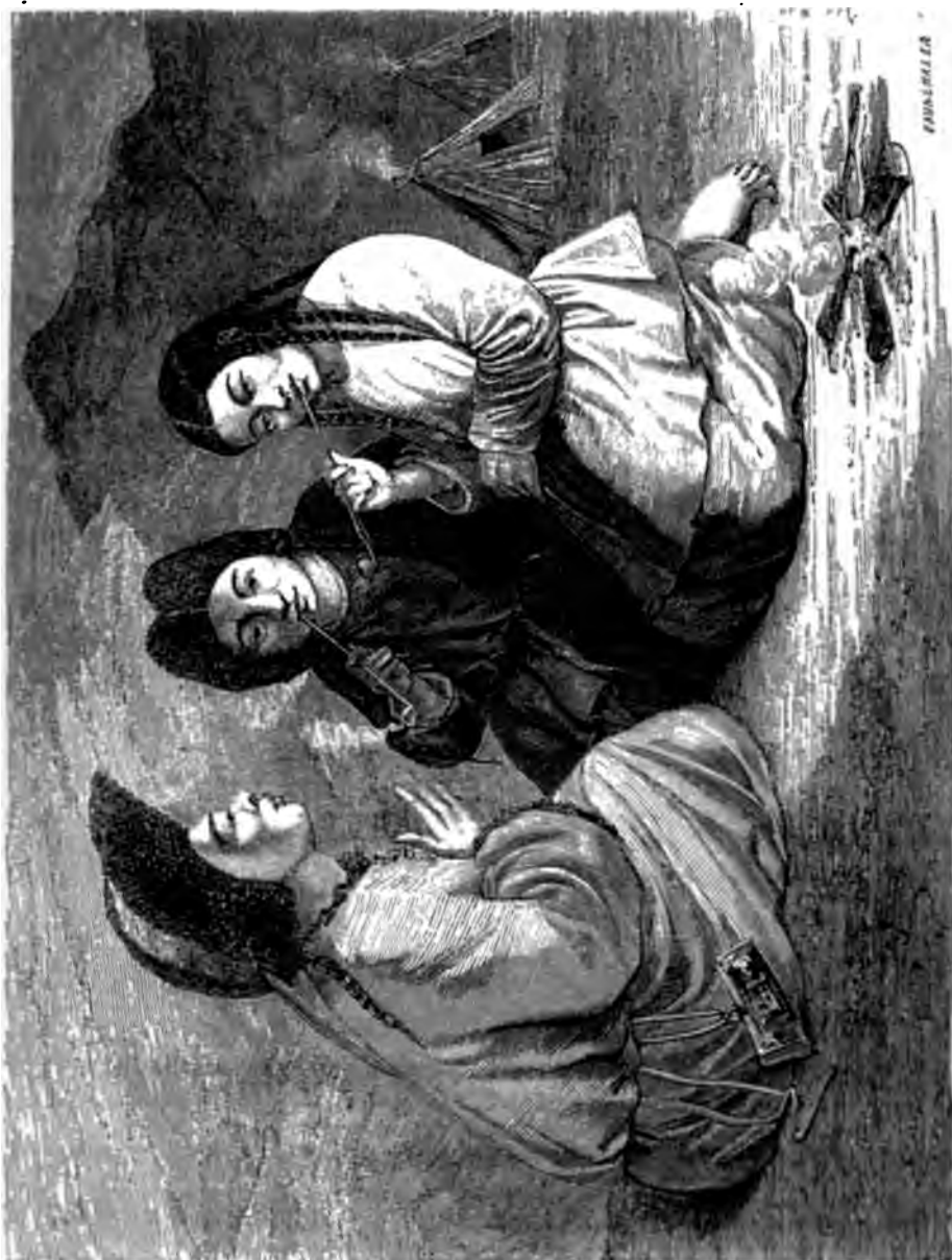
GROUP OF KALKHAS MONGOLS.