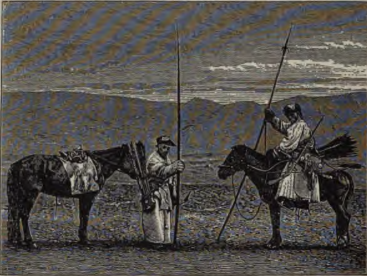
MONGOL CAVALRY (from a Photograph lent by Baron Osten Sacken).

Such were the conditions which impelled the